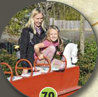
70 Folkes Park Playground