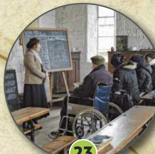
23 St. James's School