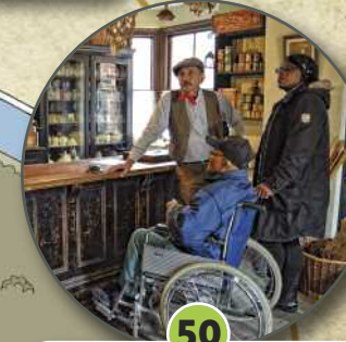
50 The Village Shops