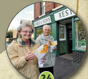
24 Hobbs Fish & Chip Shop