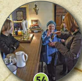
54 Bottle & Glass Inn