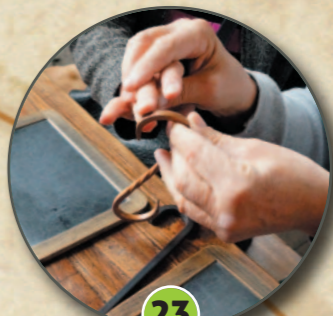
23 St. James's School