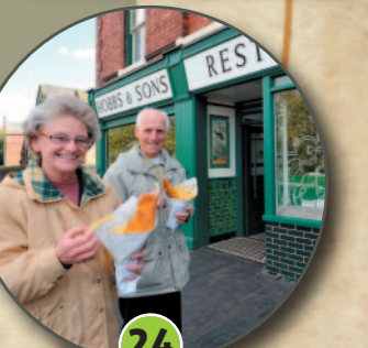
24 Hobbs Fish & Chip Shop