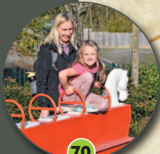
70 Folkes Park Playground