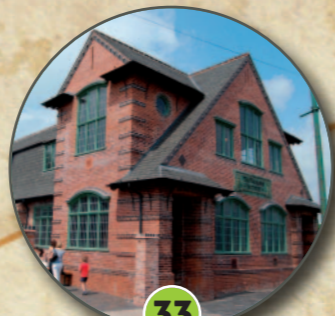
33 Workers' Institute & Café