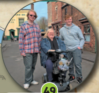
49 The Village Shops